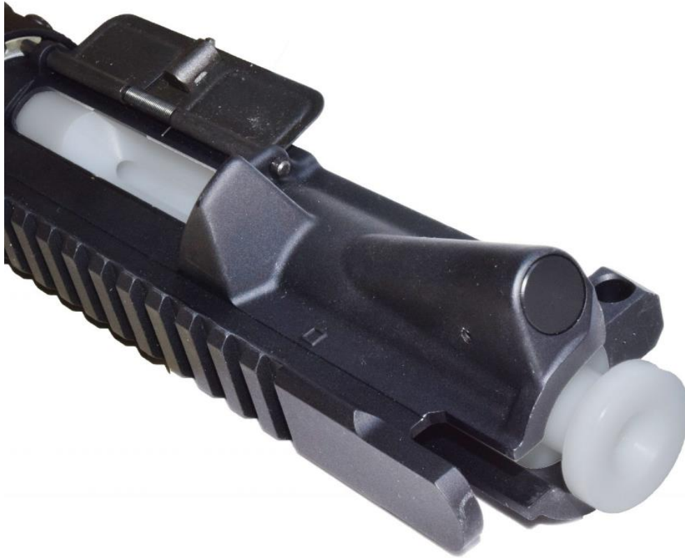
Figure 1.3 - Cleaning Rod Guide fully inserted and ready to use

To use the guide, simply remove the bolt assembly and charging handle, and insert the guide as shown in Figure 1.2. Align the solvent port with the ejection port (as shown in Figure 1.3), and push the guide until it seats fully on the barrel. A ball detent will engage in the barrel ring when the guide is fully inserted with a tactile and audible click. The bore guide is now ready to use. It will appear as shown in Figure 1.3 when installed correctly. We recommend inserting a jag and patch into the guide dry, and then applying your solvent of choice to the patch visible through the ejection port) using a pipette or eyedropper bottle.