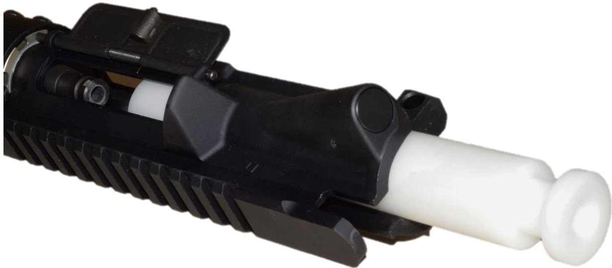
Figure 1.2 - BoreBuddy Cleaning Rod being inserted in the upper receiver

The BoreBuddy guide clicks into place with an audible and tactile snap and centers your cleaning rod to prevent bore wear and the oversize solvent port cut into the side of the guide allows for easy application of your favorite solvent. There are two solvent seal O-rings included with the purchase and can be installed into the internal groove at the front of the guide. Clean your 22lr AR easily and without the mess.