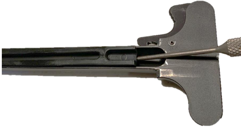
Figure 2.5 - Demonstrates how to remove the Charging Handle Insert

To remove the insert, pry from the back edge.