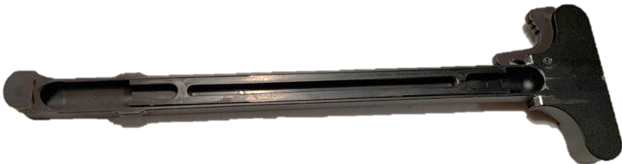
Figure 2.4 - Shows how the charging handle should look after installing the Insert. The ends of the insert are marked