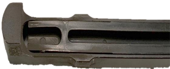
Figure 2.2 - Demonstrates improper installation that can cause damage and/or malfunctions with a conversion kit

To install, align either end of the insert with the center of the front tabs of the charging handle as shown in Figure 2.3, and press firmly into the charging handle.