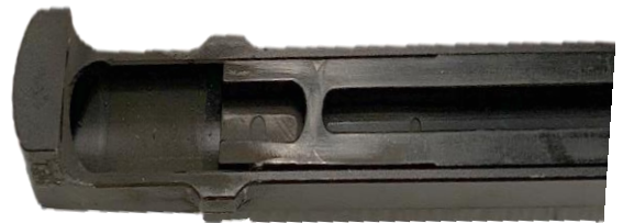
Figure 2.3 - Demonstrates correct installation